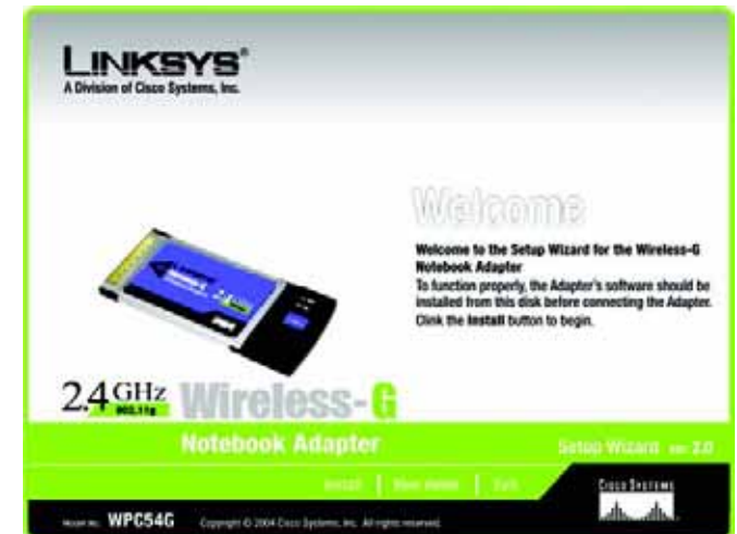
Figure 4-1: The Setup Wizard's Welcome Screen

hardware: the physical aspect of computers, telecommunications, and other information technology devices